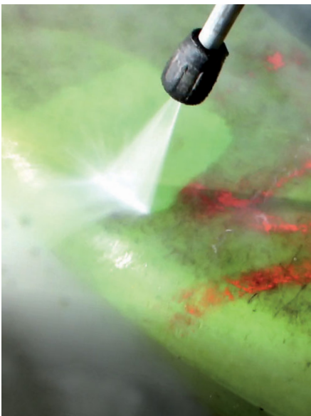
4: Even graffiti can be removed using this method.