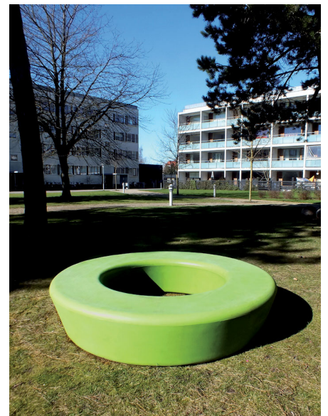
6: End result. After cleaning, use a vinyl polish (same as used for car interiors) to add some lustre to the product.